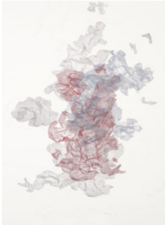
1 Imploding Monoprint 70x115cms