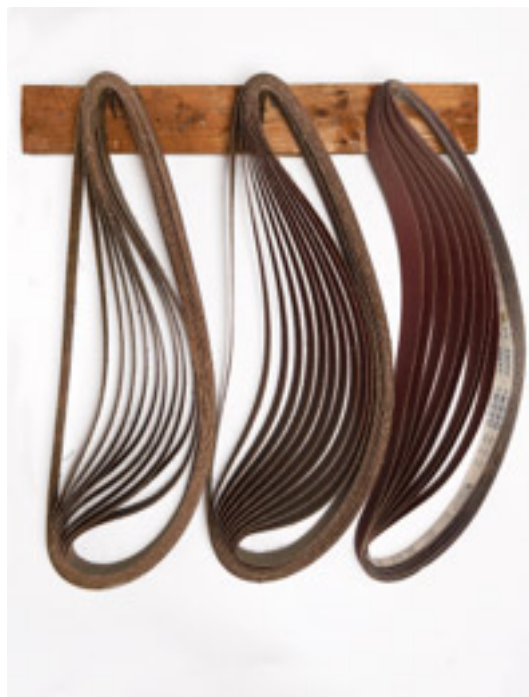
4 End of an Era, mixed media 100x120cms