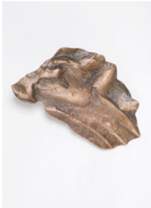
2 Between Tides, Bronze 35x30cms